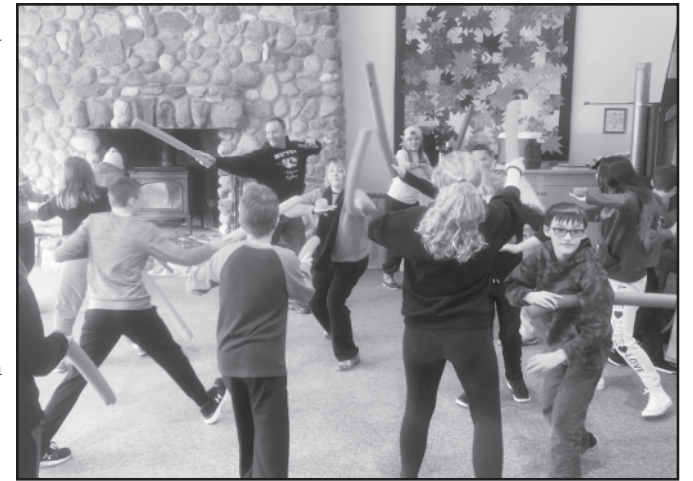
Hutchinson 6th Grade Noodle Games! ~Yes, this is team building!

The Mobile Climbing Wall is scheduled for over 20 appearances at community events around the region this summer. Check for updates on Facebook.