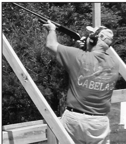
Prairie Woods has something for everyone!