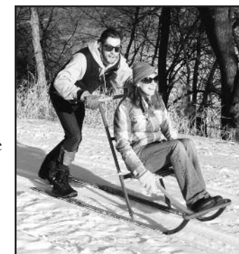
Kick sled staff training. It's a tough job but somebody has to do it!

Several winters of low snow and brown ground have sent us searching for fun alternative winter program activities. At the end of this winter we purchased a Scandinavian kick sled and as a staff, we are getting a huge kick out of kick sledding. Kick sleds can be used on bare ice on our sloughs or also on snow with the addition of snow-runners. By next year, we hope to have a fleet of kick sleds in service for winter programs and available for weekend rentals. The kick sleds, which are imported from Norway and Finland come in several sizes to suit our small to XL sized participants. The kick sleds cost approx. $240 each and our goal is to acquire at least 15 sleds in order to outfit one group and have the sleds available for rent on weekends. If you would like to donate a kick sled with your name or the name of your business or organization attached please give Dave a call at 320-354-5894.