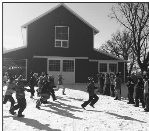
A game of Oh Deer