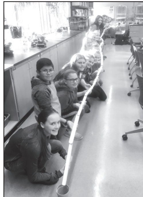
Team building with a hidden environmental message at Science Rocks.