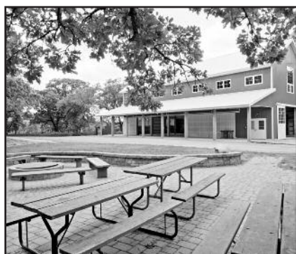
Pavilion and Johnson Memorial Firepit