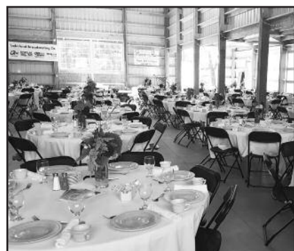
Music Under the Prairie Stars 2017

The new pavilion which was completed on June 1st, 2017 is booked for nearly every weekend this summer and 2019 is already starting to fill in. Thanks to all who contributed to the pavilion!! It has been fantastic to shelter programs in inclement weather and the facility is a popular choice for weddings and special events. Revenue from facility rentals helps to support youth programs at Prairie Woods. Please call Mari at PWELC if you would like to reserve space for your next special event.