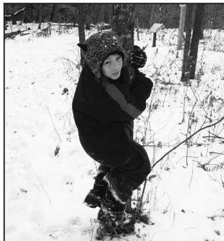
Come out & meet a tree!