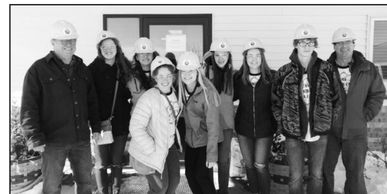
YME Team at Granite Falls Ethanol Plant