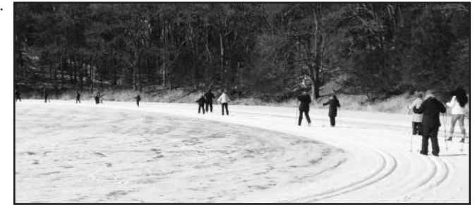
The Kettle Lake Ski Track