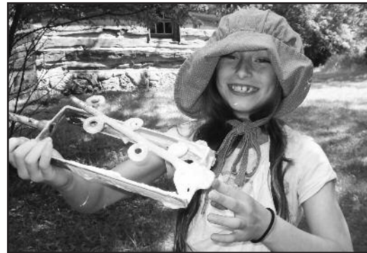
Everyone's Favorite - Ice Cream!!

As you can see, sawing wood and ice cream are usually the highlights at the pioneer cabin. If you know of a class that would benefit from a hands-on, living history experience please contact me. We have space available for fall programs. If you have a youngster that would like to be a pioneer for a day, sign them up for Pioneer Day on Aug. 14th from 8am-4pm. They'll even make their own pioneer lunch. More information on the Community Ed. Page.