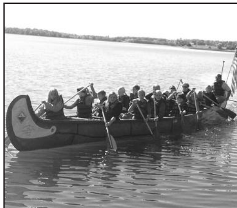
34ft Voyager Canoe ~ Because we're all in the same boat!

Please remember Prairie Woods in your estate planning and annual giving.