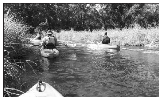
Yellow Boats Project - Look for opportunities this summer to paddle the Middle Fork of the Crow River

Some of the exciting events coming up include Earth Day and the Recycled Outdoor Gear Sale on Sat. April 21st, The Governor's Fishing Opener in May, Paddle the Crow in June, and dozens of opportunities to climb, kayak or canoe with us throughout the summer. Check our website and Facebook to stay up on our outreach programs or give us a call to schedule your customized experience at Prairie Woods.