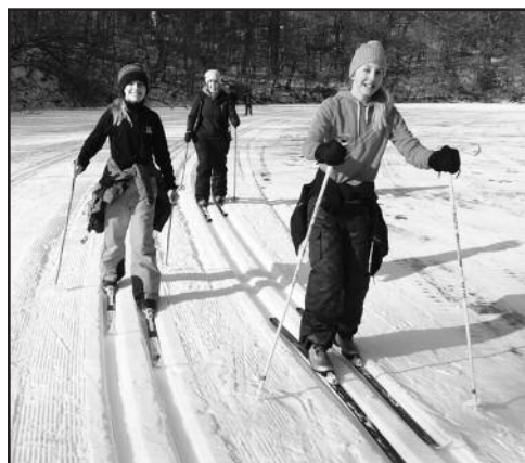
Little snow... No problem, ski the track on Kettle