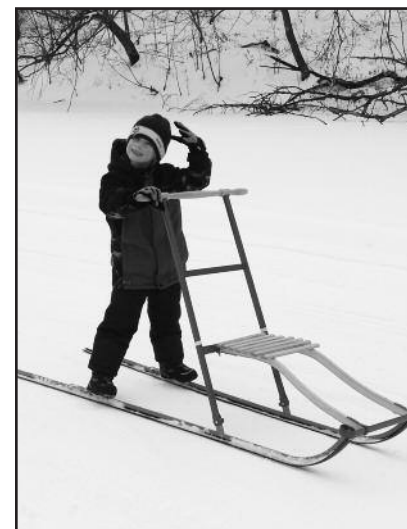
Something anyone can do - even a goofy 6 year old!

The Prairie Stars Event has become the premier fundraising event of the year for PWELC and we are excited to hold the event in the Pavilion for the second time. Please plan to join us on Friday, Sept. 7th and please consider taking a sponsorship role to help support this seriously fun event to advance the work of PWELC.