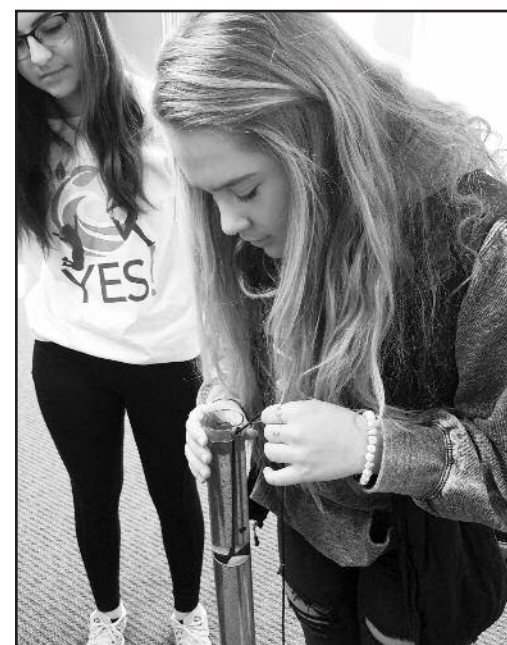
NLS student taking secchi tube readings at a Winter Workshop