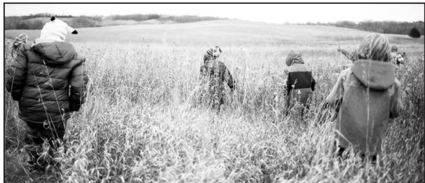
and frolic through the prairie!

Please remember Prairie Woods in your estate planning and annual giving.