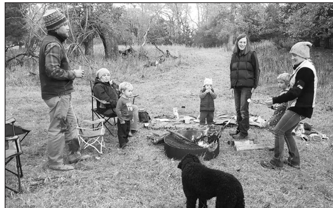
Staff & future staff enjoying the first campout on Geer Island.