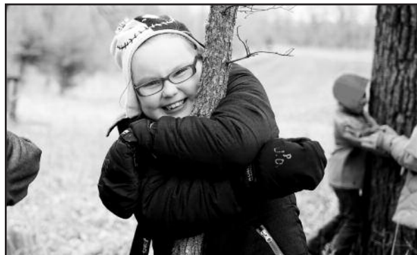
Yes, we really do hug trees

And we are not done yet!!! Having just added a fleet of 20 Yellow Boats (kayaks) to our inventory, look for upcoming river trips this spring on the North and Middle Forks of the Crow River as well as paddles on the Sauk River.