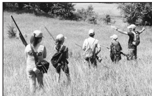
Learning firearm safety at 5 day Forkhorn Camp.