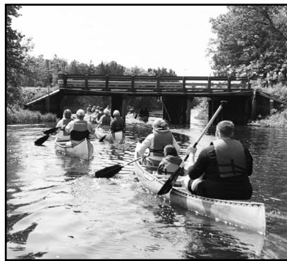
Paddle the Crow 2019