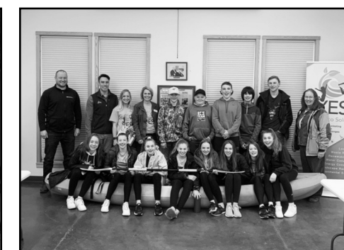
NL-S Middle School Students at the Help Our Water Workshop