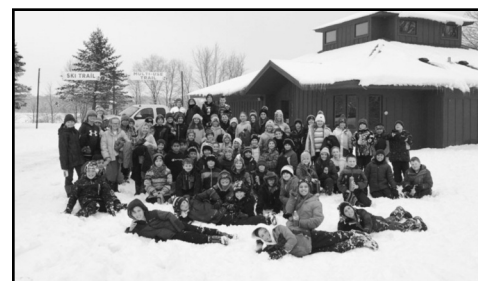
Cold Spring 4th Grade Field Trip to Waner Lake County Park

This summer, PWELC will offer multiple opportunities to take part in one of our many community programs. The Mobile Rock Wall will make its annual summer tour throughout the area at different events. PWELC will also offer a paddling series that gives participants the chance to kayak area lakes as well as the Crow River with our guides. Please don't hesitate to contact us to learn more about these community offerings or to schedule a private experience for your group. We're always happy to help plan your next outdoor adventure. Climb on!