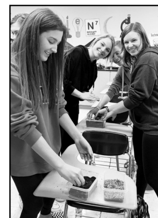
Lac qui Parle Valley Students Making Native Seed Bombs