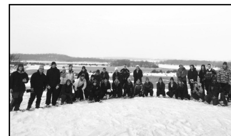
Paynesville High School Snowshoe