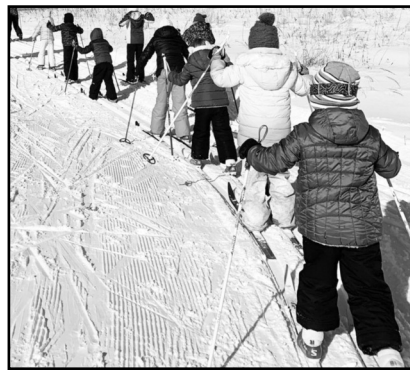
Little skiers conquering their first hill.

Then we will see whether the weather will hold out for summer programs like Paddle the Crow the 1st Saturday in June and Yellow Boat paddle adventures throughout the summer. Whatever the season, and whatever the weather, plan to join us for some great outdoor fun with PWELC.