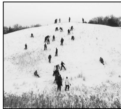
The Hills are crawling with Snowshoers