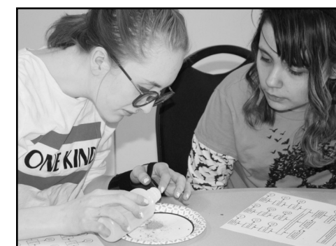
Students determining soil texture at the Southern Prairies Workshop