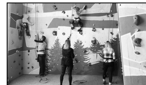
Winter Fun Day 2020 Indoor Climbing Wall