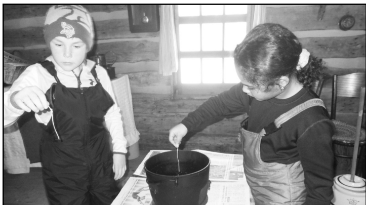
Candle Dipping...Dip by dip, layer by layer

If winter survival isn't your "thing" but a day in the life of a pioneer sounds great to you, consider signing up for Pioneer Day on Wednesday, July 15th from 9am-4pm. Anyone entering grades 3-6 is invited to be a pioneer for the day, including making your own pioneer lunch for $35. More details are in the Community Education section.