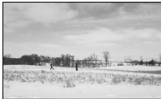
A perfect blue sky ski day