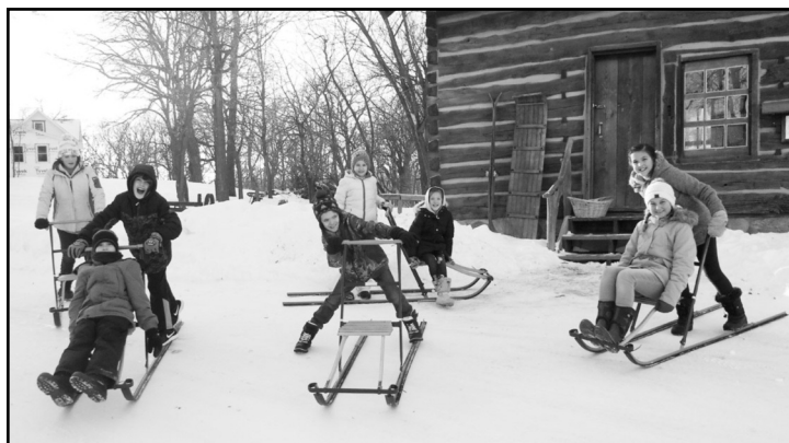
Never too cold to kicksled