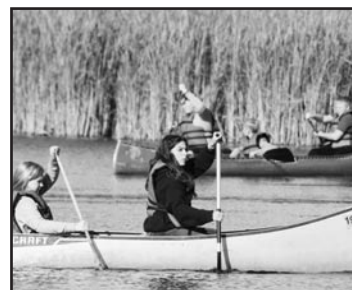
Students paddle the Lake Florida sloughs to gather water samples.