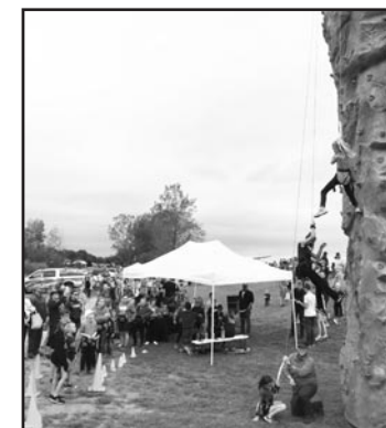
Youth Outdoor Activity Day 2019