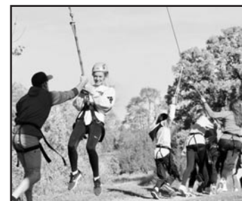
A group of students working together to pull their peer into the air!