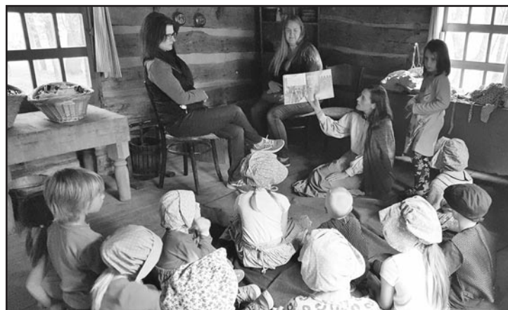
Story Hour at the Pioneer Cabin