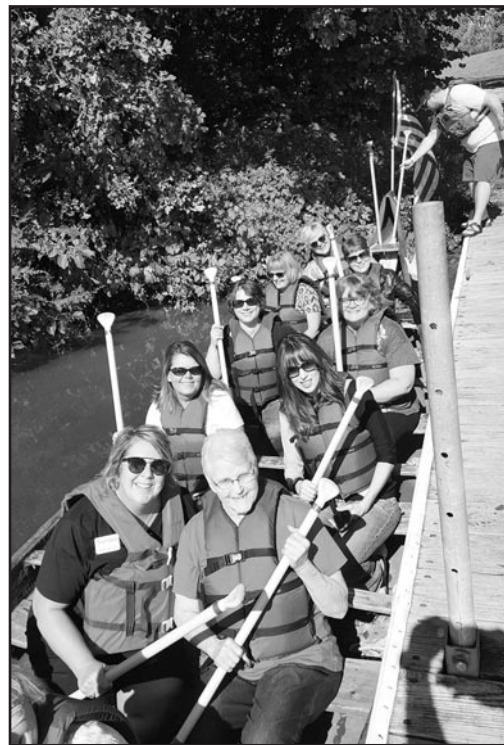
Ready for an adventure in the big canoe

Online Membership renewal is now available through the PWELC website (prairiewoodselc.org). Please renew your membership today and encourage your friends, family and neighbors to join us as well.