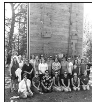
Renville County Health and Human Services