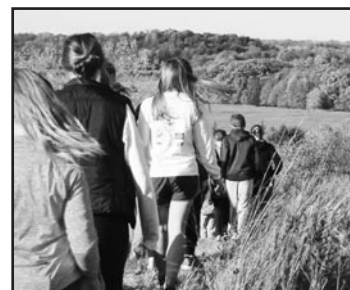
Students stand on some of the last native prairie in the state.