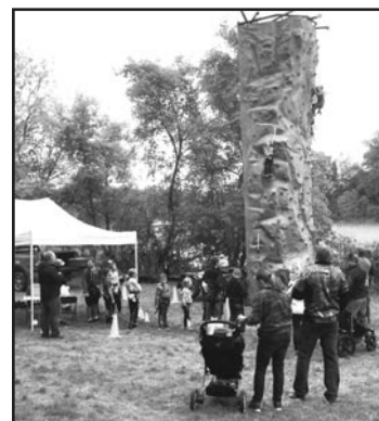
Prairie Pothole 2019

Please remember that indoor challenge course programs such as rock climbing and team building are available during the winter. Feel free to contact me anytime to design an adventure. Climb on!