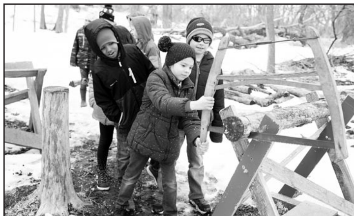
Using the buck saw to make firewood

UNITED WAY OF WEST CENTRAL MINNESOTA has awarded two grants to support PWELC youth programs in 2020. $12,000 was awarded from United Way for Everyone Outside for Serious Fun! and $3500 was awarded to help support Youth Eco-Solutions (YES!) teams in our area during 2020. United Way has been a great partner over the years and we are pleased that PWELC can use United Way funding to provide services to many other recipients of United Way funding such as scouts, treatment programs and youth groups in our area. Thanks to all who support the United Way of West Central Minnesota.