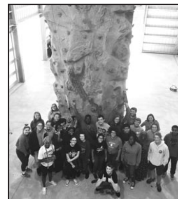
Upward Bound CSBSJU