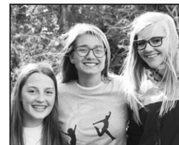
We Are YES!