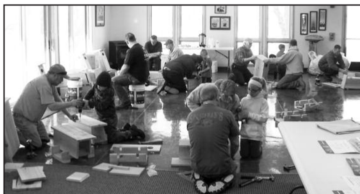
"MWA Habitat Day 2013"

Approximately 100 people visited Prairie Woods on a sunny Saturday morning in March to construct over 45 wood duck boxes. A big thanks to the Prairie Pothole Chapter of Minnesota Waterfowl Association for putting on this great event each year. Over the years this event has helped to produce hundreds of wood duck boxes and thousands of wood ducks. If you missed out on Habitat Day be sure to look for it next year and check in with the MWA booth at the upcoming Earth Day 2013 event at Prairie Woods.