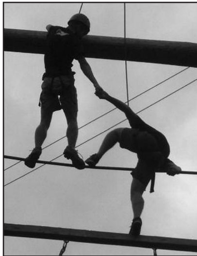
"Friends in high places"

Spring has arrived!! That means we are all starting to think about warm weather, green grass, longer days filled with sunshine and the sounds of birds and frogs. Here at Prairie Woods it also means the start of a very