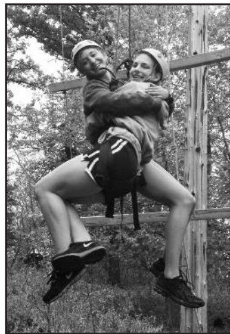
"Giant Ladder Buddies"