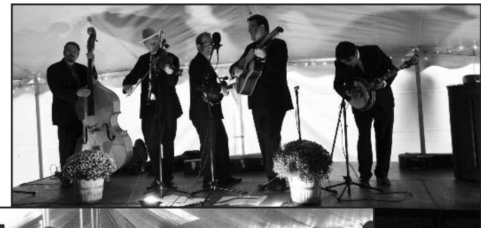
"The High 48's"