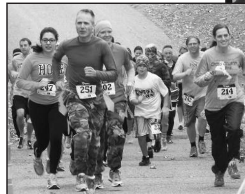
"Head's Up for Zombies"