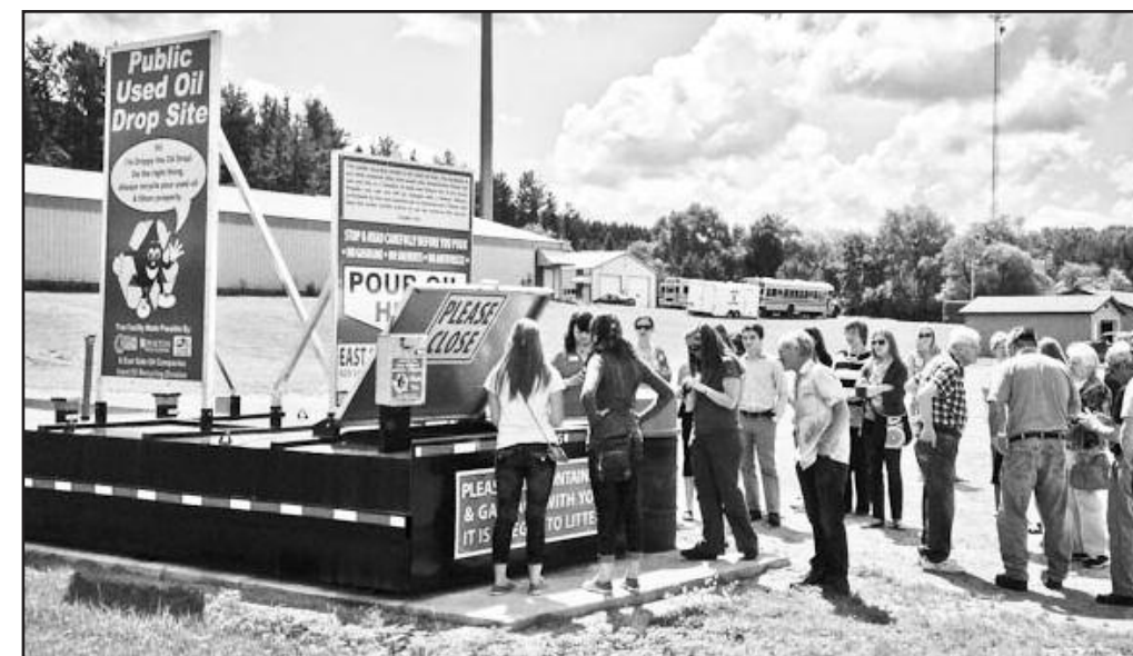
Royalton YES! team Waste oil collection site

Beto's Auto Repair, Clark's Auto Clinic, Fatty Daddy Auto Import & More Repair, Fleet Pride, Grand Rental Station, Jennie-O Turkey Store, Larry's Power Equipment, Little Crow Sports Center, Robbie's 9 & 71 Auto Body and Glass, Spicer Power Products, and Walt's Soft Cloth Car Wash.