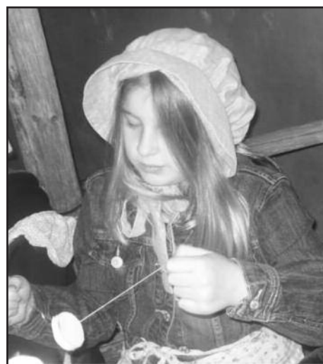
Fun with pioneer buzz saw toys