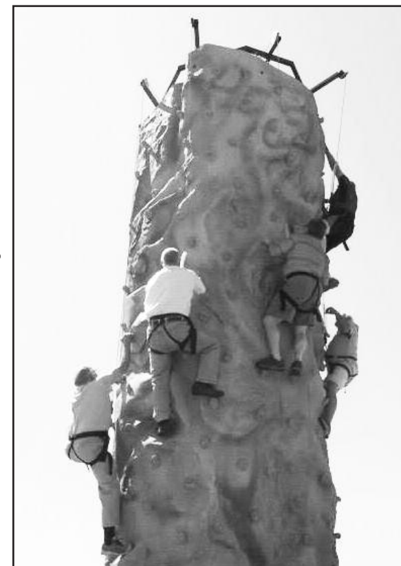
"Not just for Kids!"

The portable climbing wall is boosting our on-site capacity as well as providing another great option for groups who would prefer to have programs delivered to the site of their choice. The Prairie Woods Pinnacle paired with the Big Canoe can make for an unforgettable outdoor experience for your community. We expect that outreach programs with the big canoe and climbing wall will enable us to reach thousands more people each year. That's big news.