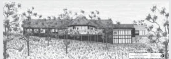
A rendering from Engan Associates Architects shows the proposed expansion of Prairie Woods' Education Building.

Prominent philanthropist, Earl B. Olson, founder of Jennie-O, has offered a $100,000 matching gift challenge to spur contributions for facility expansion at Prairie Woods.